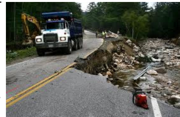
Kancamagus washed out by Irene.

CAMPTON — The U.S. Forest Service has received more than $4 million in disaster relief funding to repair trails and roads on the White Mountain National Forest that were damaged by Tropical Storm Irene last August, U.S. Senator Jeanne Shaheen (D-N.H.) announced recently. "Hurricane Irene had a devastating impact on many areas in the state and these funds will ensure that repair work can be completed," Shaheen said. "These roads and trails need to be repaired so residents and tourists can safely access the great resources offered by the White Mountain National Forest."